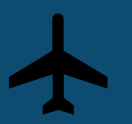
ER/Urgent Care Coverage When Traveling