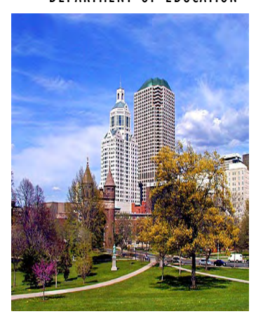
Summer 2008 in Hartford, CT