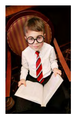
Back to Inside this Issue

Districts sent representatives to the September SEDAC trainings presented by the Bureau of Data Collection, Research, and Evaluation. Participants were able to review some of the new changes to the system detailed in the SEDAC presentation. Participants received the SEDAC handbook. Please contact <u>Laura Guerrera</u> by phone 860-713-6898 with questions about future trainings or with regards to either the handbook or presentation materials.