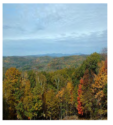
Mohawk Mountain Magic –Fall approaches Connecticut.

CONNECTICUT STATE DEPARTMENT OF EDUCATION