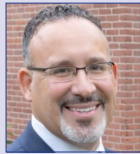
Miguel A. Cardona Commissioner of Education 860-713-6500 miguel.cardona@ct.gov