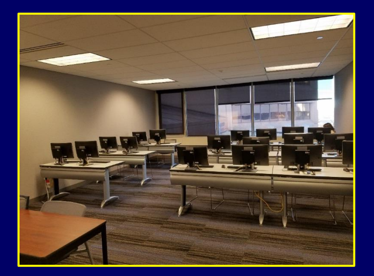
New CSDE Training Room