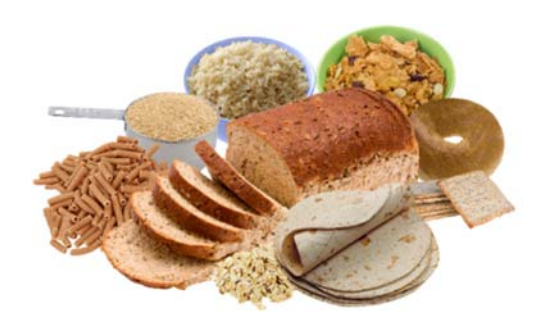
Table 2 shows examples of foods to avoid and allow with celiac disease. For more information and resources, see "Celiac Disease" in the CSDE's Special Diets resource list.