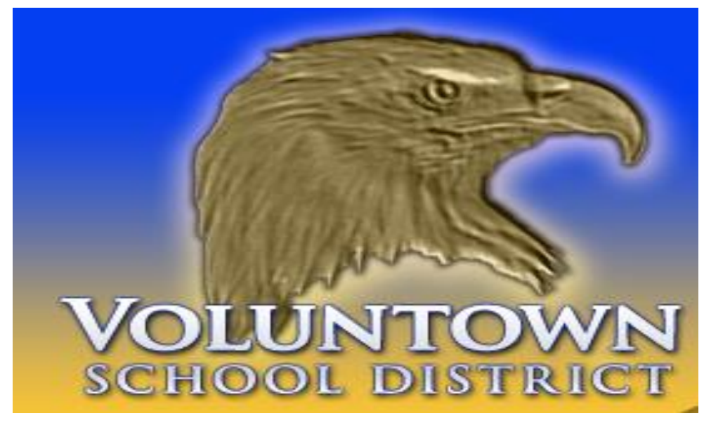
Professional Learning and Evaluation Plan