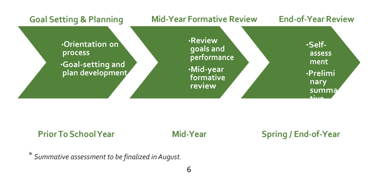
Figure 1: This is a typical timeframe:

Superintendents can determine when the cycle starts. For example, many will want their principals to start the self-assessment process in the spring in order for goal-setting and plan development to take place prior to the start of the next school year. Others may want to concentrate the first steps in the summer months.