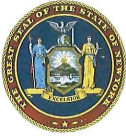
Governor Andrew M. Cuomo STATE OF NEW YORK