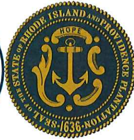
Governor Gina M. Raimondo STATE OF RHODE ISLAND