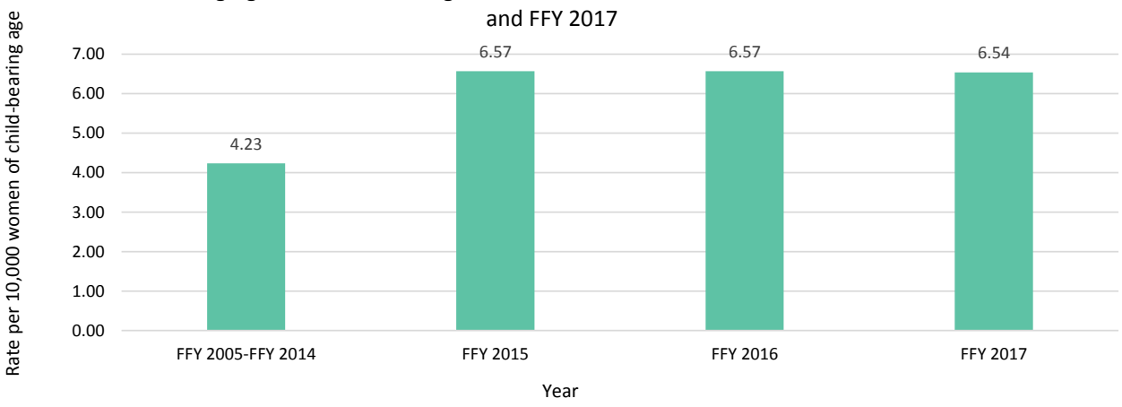
Rate of Neonatal Abstinence Syndrome-Related Hospital Discharges per 10,000 Women of Child-Bearing Age in Connecticut, Ages 15-44 Years, FFY 2005 – FFY 2014, FFY 2015, FFY 2016

Note: FFY, federal fiscal year, defined to be October 1 – September 30 of each year. Rates are only calucated for towns with 20 or more cases in both time periods due to the high variability of rates associated with small numbers. Data source is the CHIME Hospital Discharge data and and Population Statistics data avaiable from the Surveillance Analysis and Reporting Unit at the Connecticut Department of Public Health.