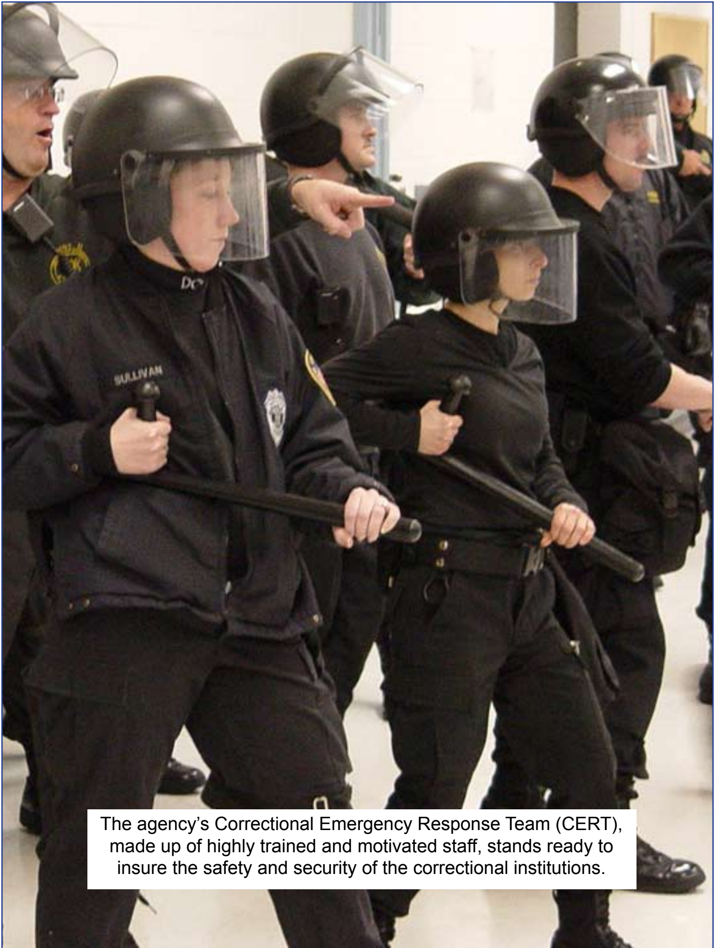
The agency's Correctional Emergency Response Team (CERT), made up of highly trained and motivated staff, stands ready to insure the safety and security of the correctional institutions.