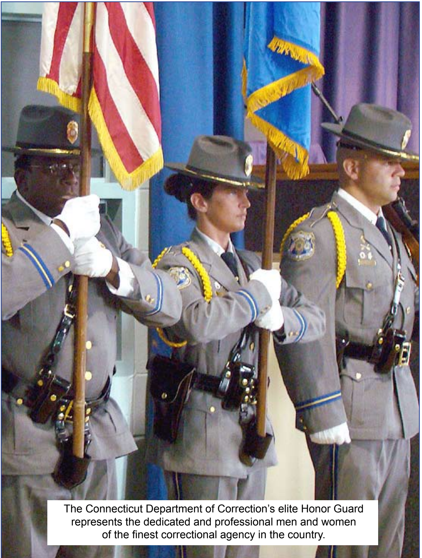
The Connecticut Department of Correction's elite Honor Guard represents the dedicated and professional men and women of the finest correctional agency in the country.