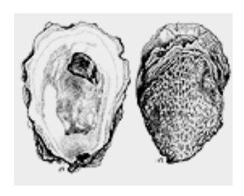
Eastern Oyster Crassostrea virginica The eastern oyster grows in intertidal and subtidal waters attached to rocks, pilings and shells. Oysters can attain a