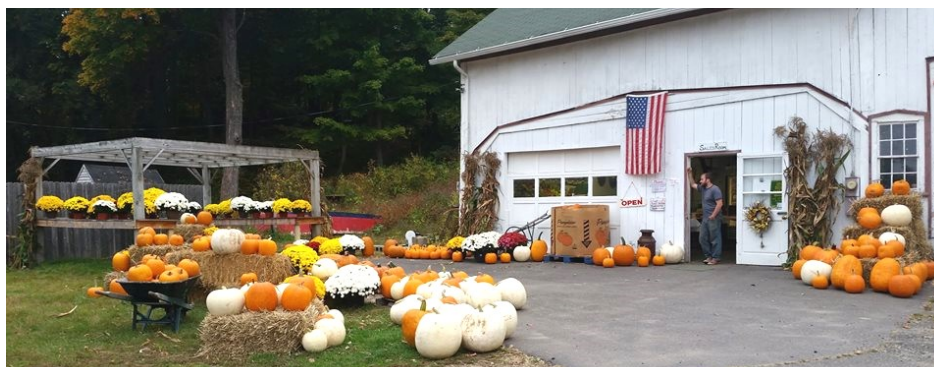
Bristol's Farm in Canton, CT was preserved through DoAg's Community Farms Preservation Program. Bristol's Farm Market is open May through October and offers seedlings, flowers, produce, and CSA shares.

do not meet the criteria of the state's flagship Farmland Preservation Program for reasons of size, soil quality, or location, but may contribute to local economic activity through agricultural production.