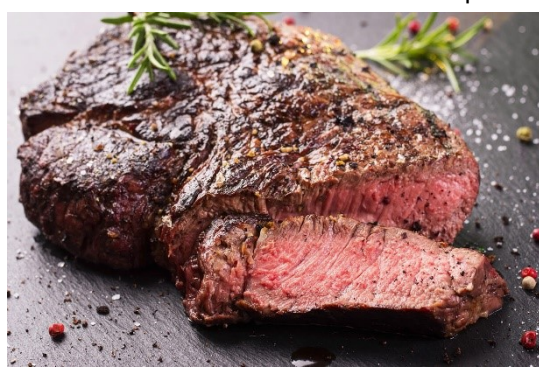
Connecticut Grown ribeye steak.

part of a larger project that has transformed the Monahan's farm business from a roadside stand into a full service market that offers hot and cold foods prepared by a chef in the new commercial kitchen, using meats and vegetables grown on the farm.