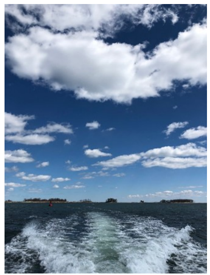
A picture of Branford, CT that was uploaded to the app during a manual observation.

Using the app is very simple. There are two different modes of entering information: passive and manual.