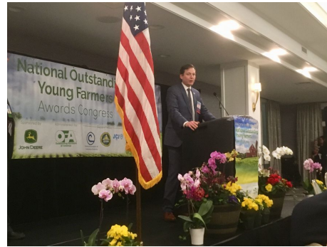
Commissioner Bryan Hurlburt addressing attendees at the National Outstanding Young Farmer Awards Congress in Westbrook, CT.