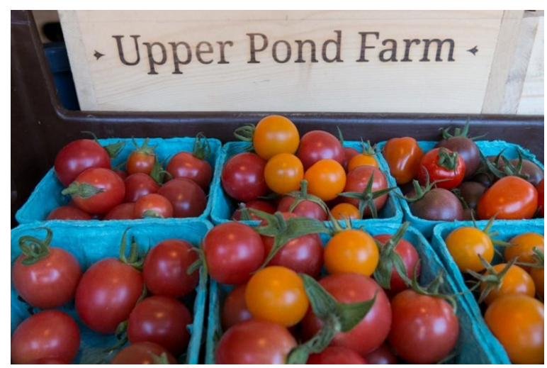
Baylee believes in marketing her crops locally.

Baylee also serves as a voice for local farmers in her community by serving on the New London FSA County Committee. She is serving in an appointed position and brings a unique perspective as the only vegetable farmer on the committee.