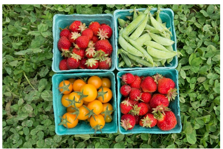
College changed Baylee's perspective on agriculture and piqued her interest in growing vegetables.

Baylee monitors soil compaction, grows cover crops and takes measures to prevent soil erosion.