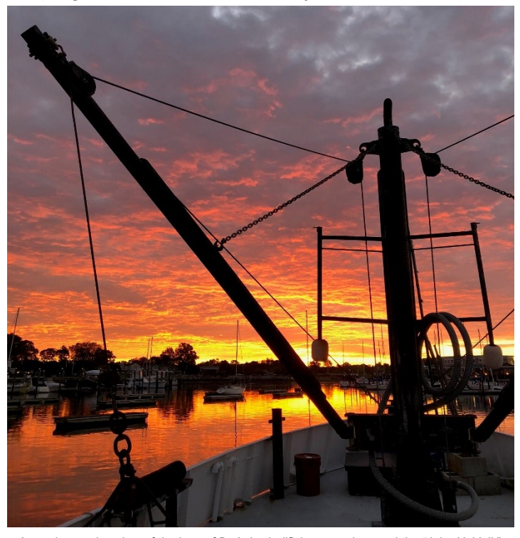
An early morning view of the bow of DoAg's shellfish research vessel the "John H. Volk".

Known as the UNH Canal Dock Laboratory, it will have a floating dock system enabling DoAg's vessel to work with students at the facility.