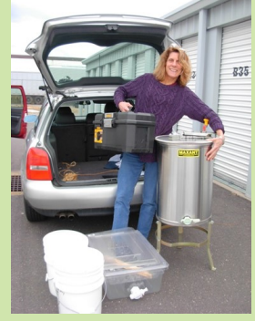
A beekeeper picking up extractor equipment at the storage facility.

Connecticut Department of Agriculture January 31, 2018