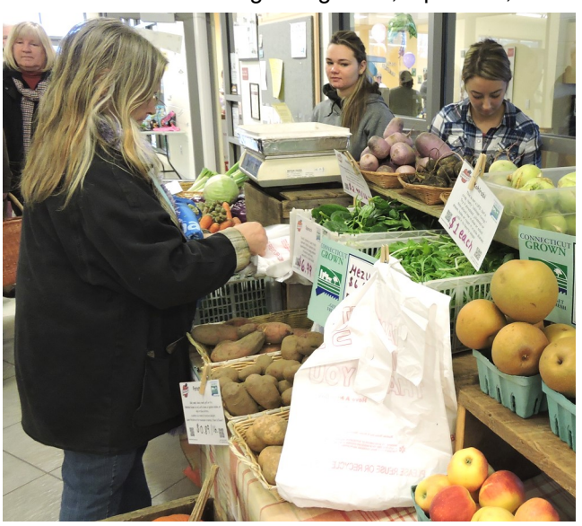
The Ellington winter farmers' market located at the Indian Valley Family YMCA.

Erin said there are lots of root vegetables for sale at the CitySeed winter market along with greens, squashes, and fruits.