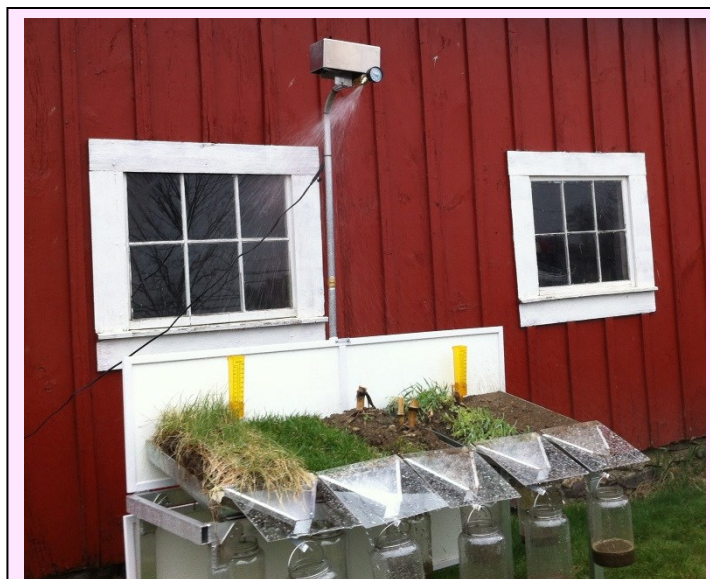
This NRCS rainfall simulator demonstrates water runoff and penetration in relation to crop management using traditional till, conservation till, and no till.

The Connecticut Farm Bureau Association currently represents agricultural interests on the WPCAG, while the Connecticut Department of Agriculture serves on both the Water Company Lands and the Drought Plan/Model Water Use Ordinance work groups of the WPCAG, and regularly attends WPC and WPCAG meetings.