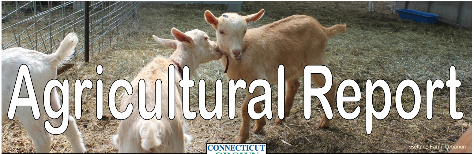
Beltane Farm, Lebanon