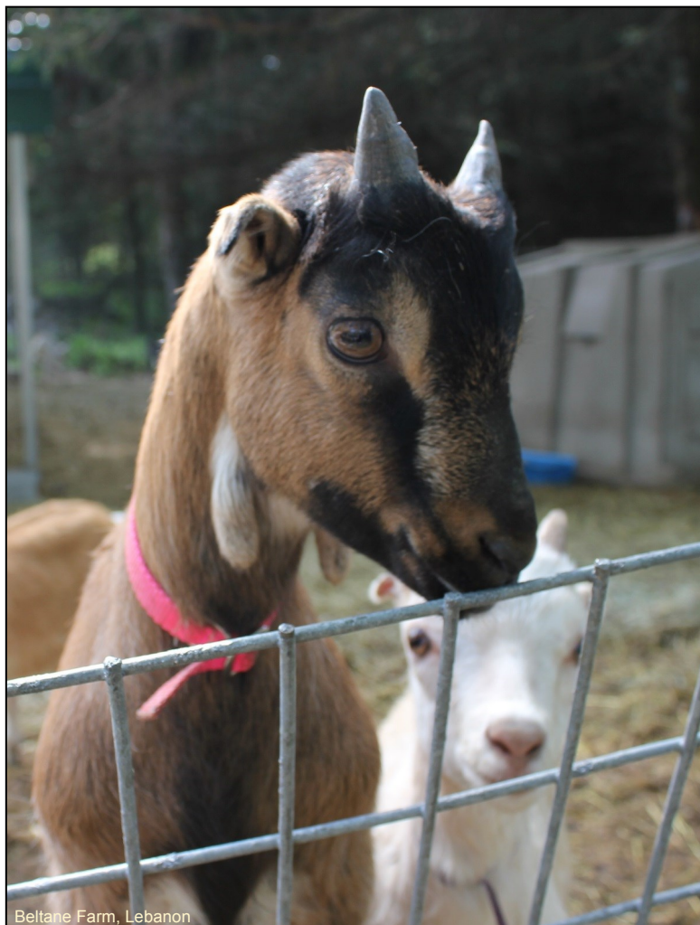
Beltane Farm, Lebanon

For more information about these efforts, call 860-713- 2508.