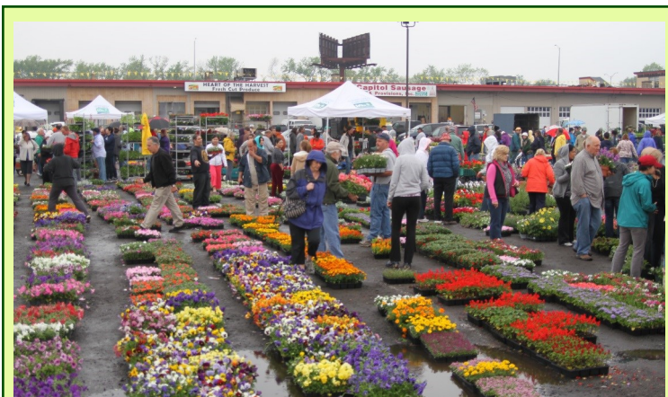
Shoppers at the farmers' market at the Hartford Regional Market Saturday morning. Mother's Day weekend is often the busiest market day of the year.

To apply, email two to three paragraphs about your farm and why this assessment would be of value to your business to ricape@cox.net (put "Site Assessment" in the subject line). Then complete the survey found at https://www.surveymonkey.com/s/agritourism2013 to help RICAPE assess your interests and business. The deadline to apply is May 31, 2013.