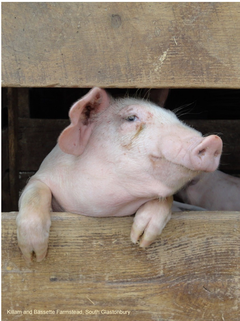
Killam and Bassette Farmstead, South Glastonbury

Anyone who may be interested in applying for such a position in the future should take the exam now. Please see the Job Opportunities page of DoAg's website at http://www.ct.gov/doag/cwp/view.asp?a=1406&q=260136&doagNav= for exam details.