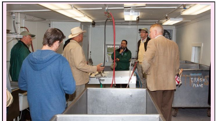
Governor Malloy tours Ekonk Hill Turkey Farm, one of the participants in the Connecticut Small Poultry Inspection Program

The inspection follows the requirements of the PPIA, including an audit of the HACCP system and an evaluation of the sanitation, sanitary practices, food-handling equipment design and construction, handling of animals, record-keeping, and water supply.