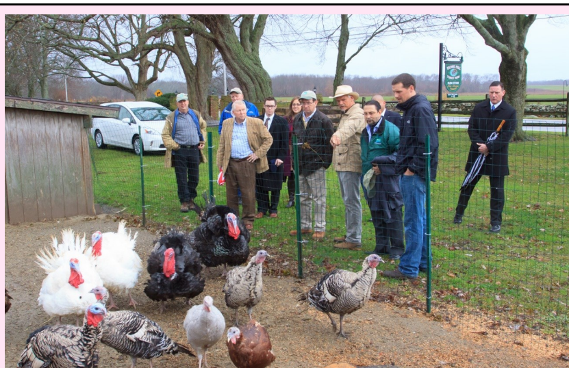
Governor Malloy at Ekonk Hill Turkey Farm, which participates in the Connecticut Small Poultry Processor Inspection Program. Governor Malloy’s proposal to expand the program to include retail sales passed during the 2013 legislative session and is now state law.