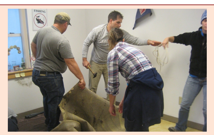
Staff rip up damaged wall-to-wall carpeting and linoleum tiling

Thanks to the thorough preparation taken by Aquaculture personnel, damage was limited to exterior shingles and siding and interior carpets and flooring. No records or laboratory equipment were lost or harmed in the flooding. Staff remained on site to safeguard the facility until high tide on Monday of the storm forced evacuation, and returned first thing Tuesday morning to assess damage and begin recovery. The office reopened the following day and all hands pitched in to remove damaged materials and facilitate repair work.