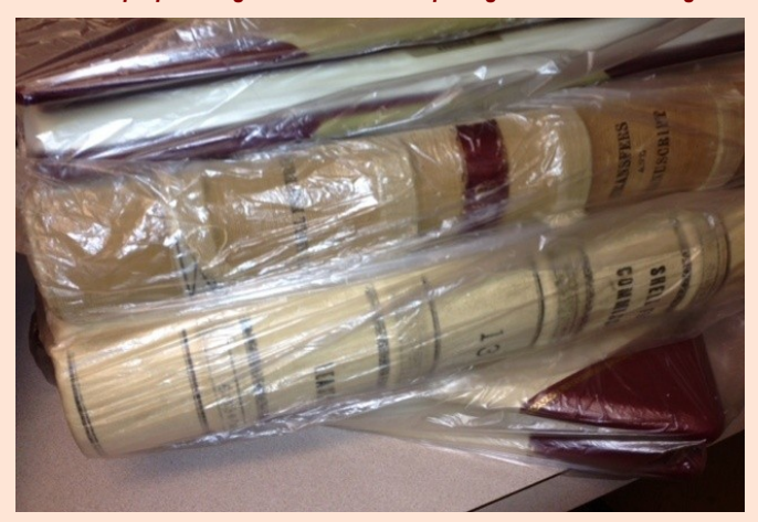
Important documents and records protected by thorough preparation