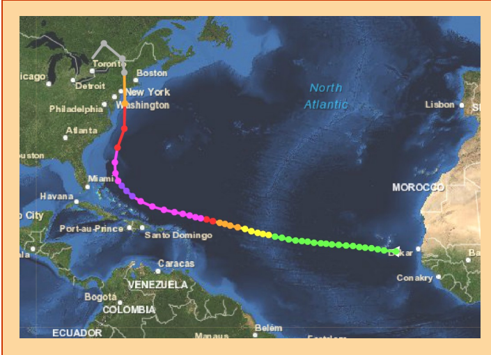
NOAA photo showing track of 1938 hurricane

This is by no means an all-inclusive guide. Numerous resources are available from your veterinarian, Cooperative Extension educators, and online. A good resource for guidance in many areas of emergency preparedness on farms can be found at <a href="http://www.prep4agthreats.org/All-Hazard-Preparedness/farm-emergency-preparedness-plan">http://www.prep4agthreats.org/All-Hazard-Preparedness/farm-emergency-preparedness-plan</a>.