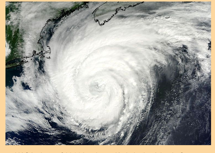
NASA photo of 2011 hurricane Katia in the Atlantic Ocean

Hurricane season is upon us. We only have to look back to last October to be reminded that Connecticut is subject to extreme weather conditions.