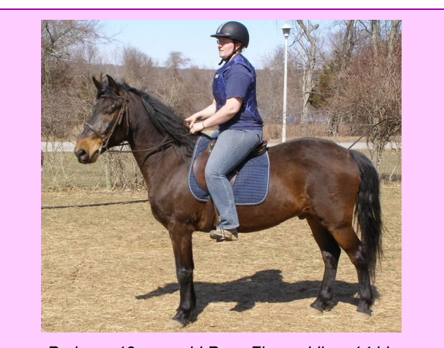
Pedro, a 12-year-old Paso Fino gelding, 14 hh