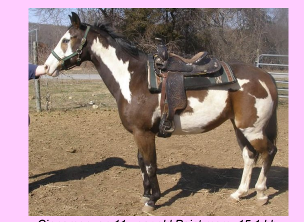
Cinnamon, an 11-year old Paint mare, 15.1 hh

The horses have current vaccinations, health certificates, negative Coggins tests, and each has a microchip (LifeChip<sup>®</sup>) for identification purposes. All records will be available to interested parties.