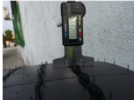
Measuring tread depth in the fully open shoulder grooves on this new tire confirms the same depth of 12.31 mm or 15/32 inch.

In some cases, inspectors may falsely believe that hidden, rain drop features do not meet the minimum tread depth requirement. In fact, these grooves are of full depth and are open from the first mm or 32 nd of an inch to the last. This can be verified with a simple tread depth gauge at all points in the tire's life. There are currently no tread groove minimum width (only depth) requirements in North America.