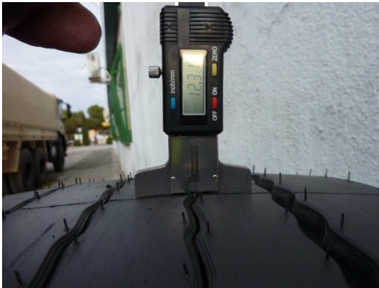
Measuring tread depth in the narrow central grooves on this new tire shows a tread depth of 12.31 mm or 15/32 inch.

STEP 8: Repeat STEPS 3-7 across the tread face at the other main circumferential grooves.