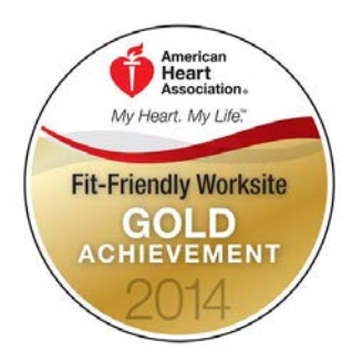
In early 2015, MTM was designated a Gold Level recipient of the American Heart Association's Fit-Friendly Worksite Recognition program.

turnover, build a better company reputation, and improve social/community responsibility and awareness. In fact, MTM was recognized by the St. Louis Business Journal for being one of the 2015 Healthiest Employers.