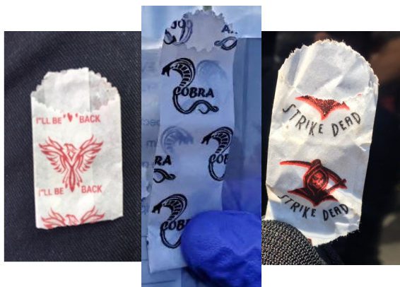
Examples of identified heroin packaging linked to reported overdoses in May. Send photos to: poisoncontrol@uchc.edu Include CPCC case number in subject line.

This important initiative demonstrates the value of EMS to the public health system and how we can play a crucial role in ending a terrible epidemic. Statewide EMS reporting began June 1, 2019.