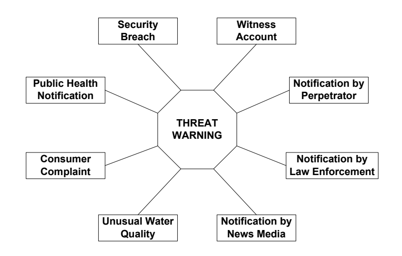
Figure III-2. Summary of Potential Threat Warnings