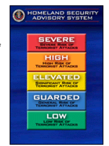
Figure III-1. Threat Condition Levels

A "threat warning" is an occurrence or discovery that indicates a threat of a malevolent act and triggers an evaluation of the threat. These warnings should be evaluated in the context of typical CWS activity and previous experience in order to avoid false alarms. The threat warnings presented in Figure III-2 and described below are intended to be inclusive of those most likely to be encountered, but this listing is by no means comprehensive of all possibilities.