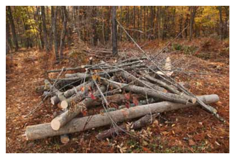
The foundation should be covered with brush, using increasingly smaller branches on top.