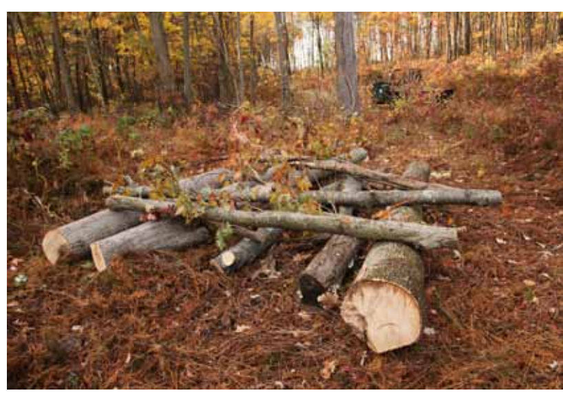
A second layer of logs is laid on top of and roughly perpendicular to the first layer.