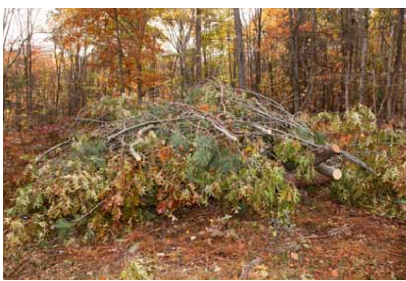
Add leafy crowns or pine boughs to the top of the pile.