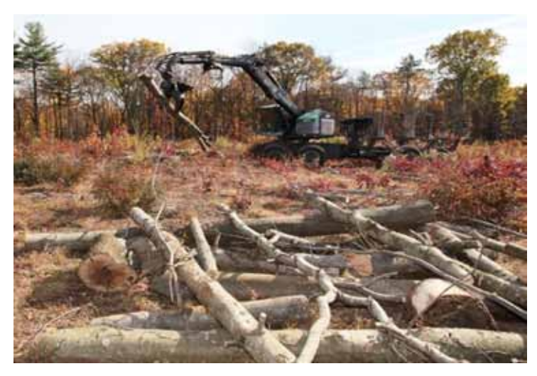
Construction of a brush pile using mechanized forestry equipment.

or tree removal operation. As with other brush pile creation, larger materials should be placed on the bottom at various angles with subsequently smaller material on top. Avoid packing the logs tightly, as this will eliminate any openings for wildlife to enter and exit the linear pile. Windrows should range from 10 to 20 feet on a side and 6 to 8 feet high. Windrows should have breaks built into them every 50 to 100 feet to provide travel lanes for wildlife.