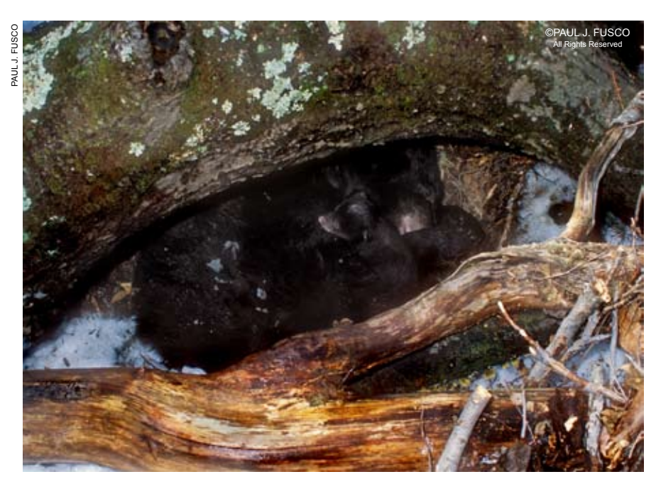
Fallen trees, brush piles, or slash piles are the most common dens used by bears in Connecticut. Bears also use rock crevasses and ledges, open ground nests, and hollow trees as dens. Grounds nests are usually a sparse mat of leaves and twigs and are typically located in thick vegetation, such as mountain laurel. Bears often den in locations that provide little shelter from the elements.

Taking precautions will minimize conflicts between humans and bears. It is important to understand that all bears are not alike and what works to scare one bear may not work with another, especially if the bear is habituated to humans. Bears should be respected not feared.