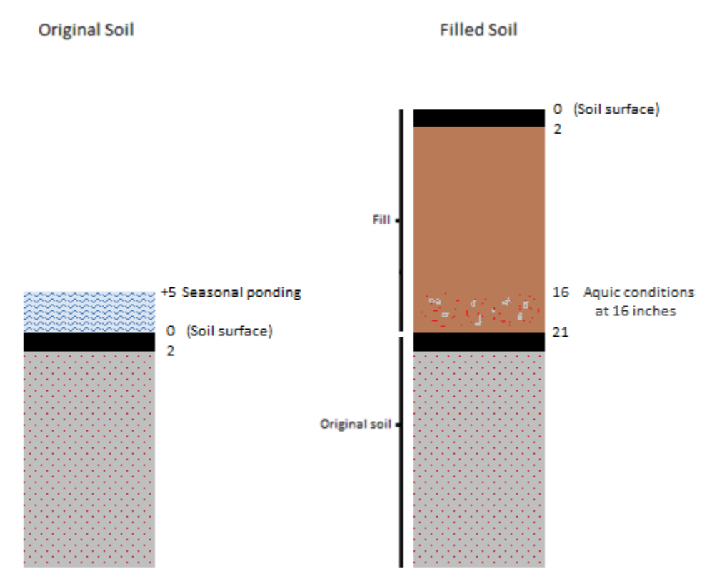
Figure 2. Example of change in depth to aquic conditions after place of 21-inches of fill

Figure 2 illustrates a case where an original mineral soil, an Aquepts suborder (very poorly drained), with morphology indicating aquic conditions at the surface and with seasonal ponding (5 inch depth over soil surface), is filled with 21 inches of human-transported material. The filled soil is reexamined in regard to aquic conditions, which are found at 16 inches (based on redoximorphic features in the overlying human-transported material). In this example, the filled soil would classify as an Aquepts or Aquents with aquic conditions within 20 inches, and meet the definition of a poorly drained soil.