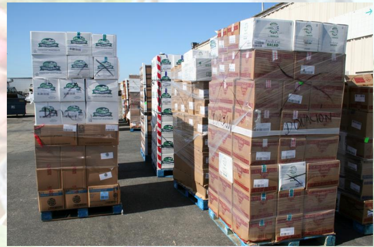
Table 9. Barriers to Donating Food