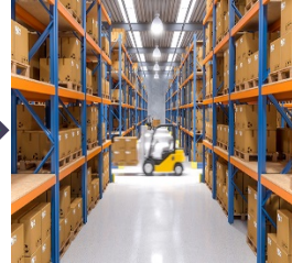
Warehouse / Distributor