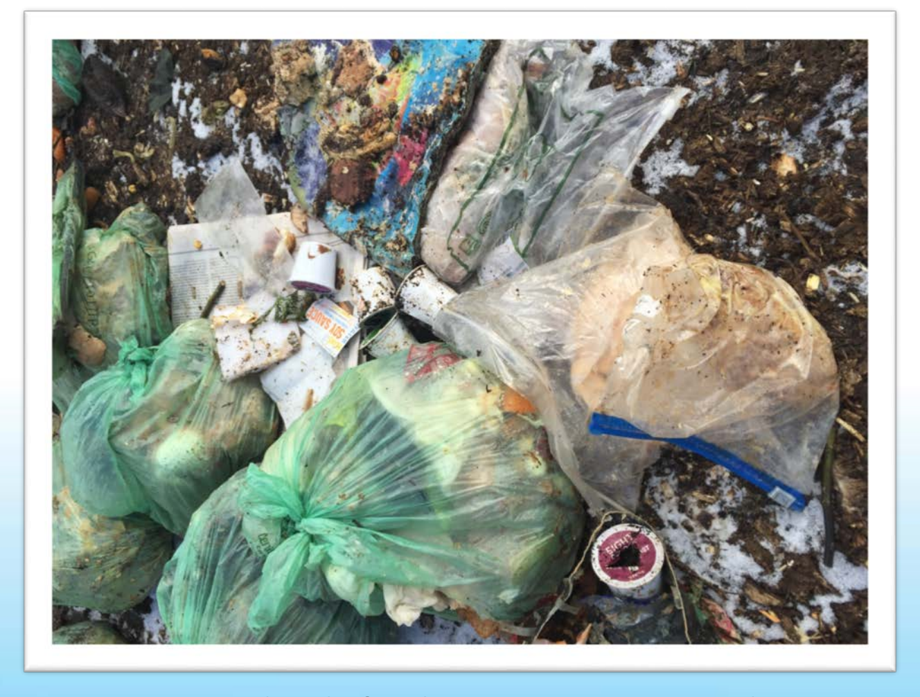
Contamination at both facilities continues to be a concern