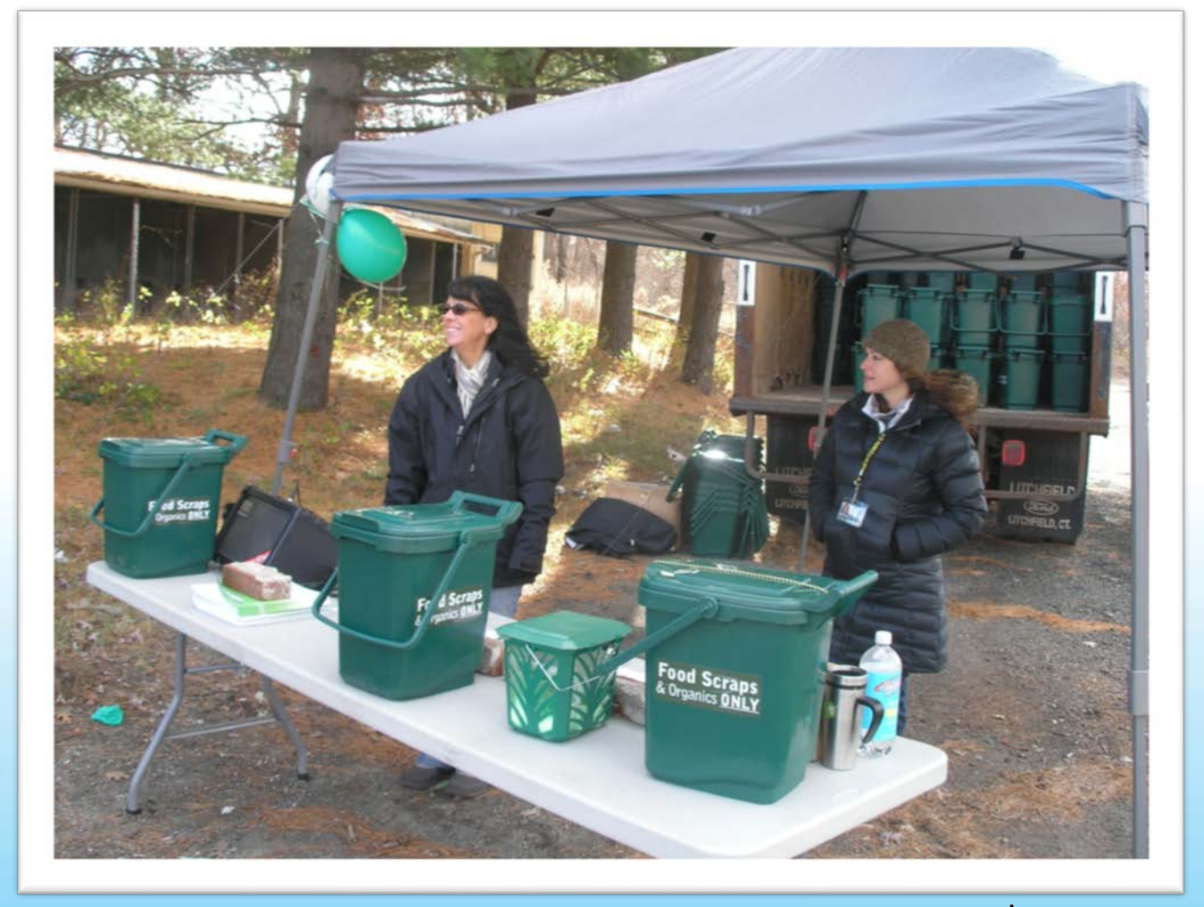
Newtown Public Works – November 14<sup>th</sup> 2015