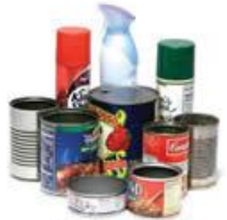
Steel, Tin & Metal Cans