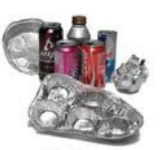
Aluminum Cans, Food Trays & Foils