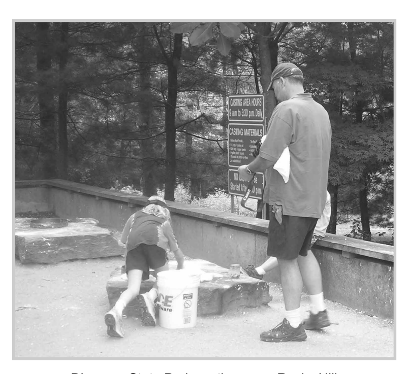
Dinosaur State Park casting area, Rocky Hill