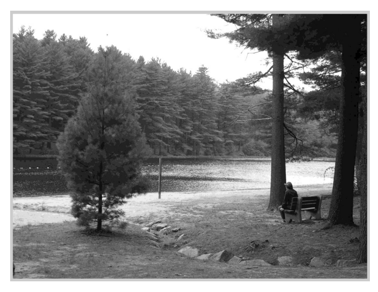
Chatfield Hollow State Park, Killingworth