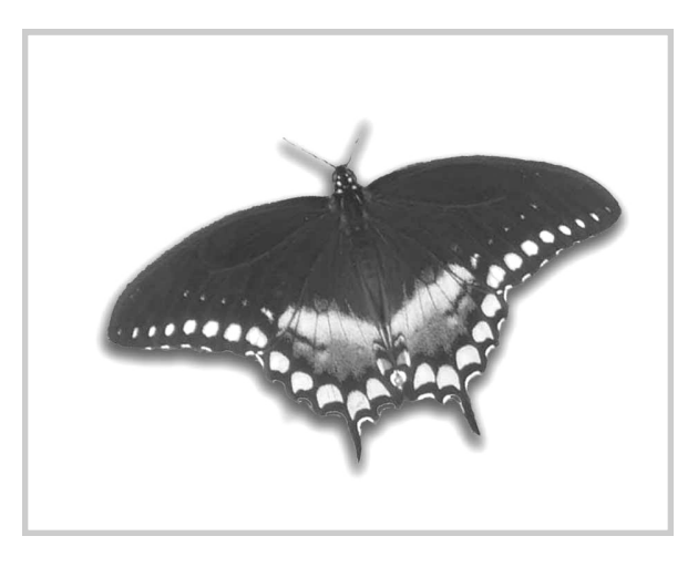
Spicebush swallowtail (Papilio Troilus) at Salt Rock Campground