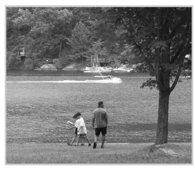
Squantz Pond State Park, New Fairfield