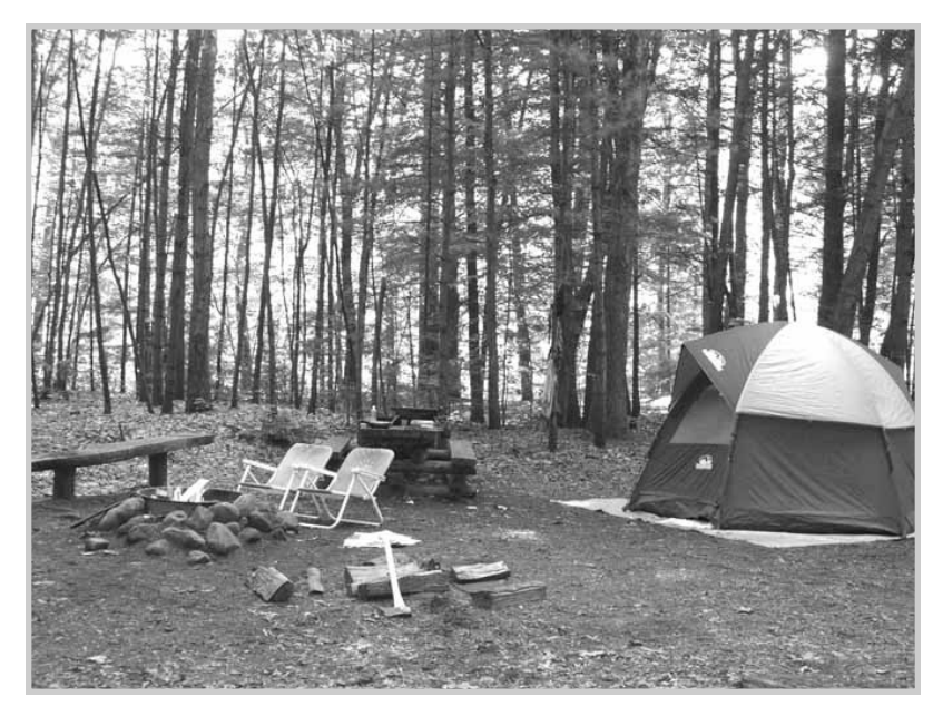
American Legion State Forest Campground, Barkhamsted