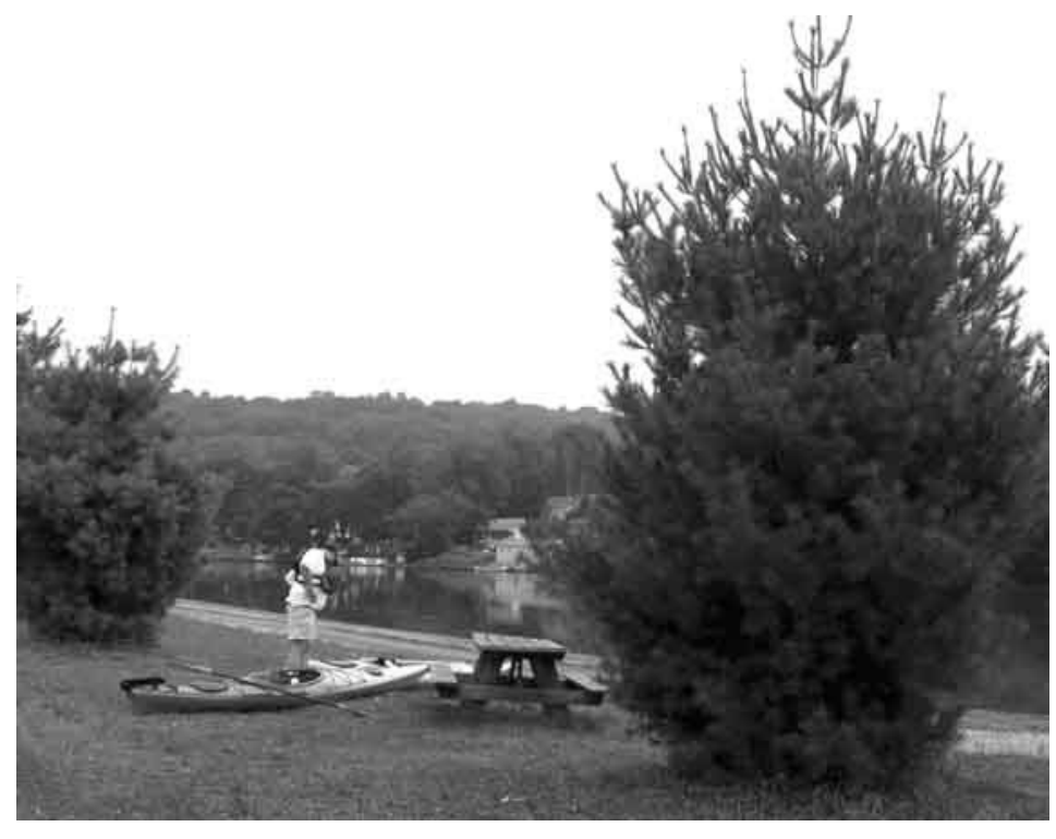
Indian Well State Park, Shelton