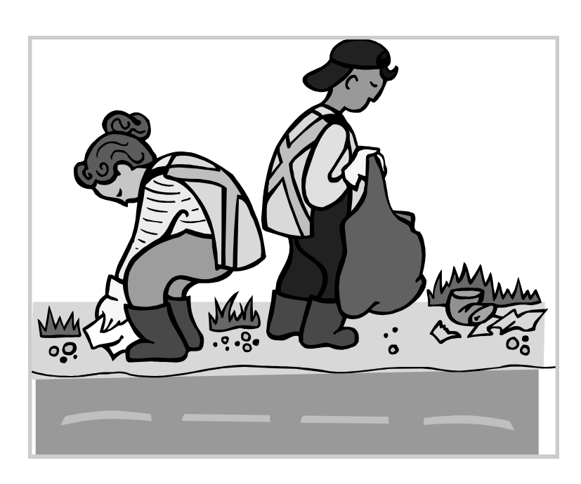
... But all other pleasures and possessions pale into nothingness before service which is rendered in a spirit of joy.