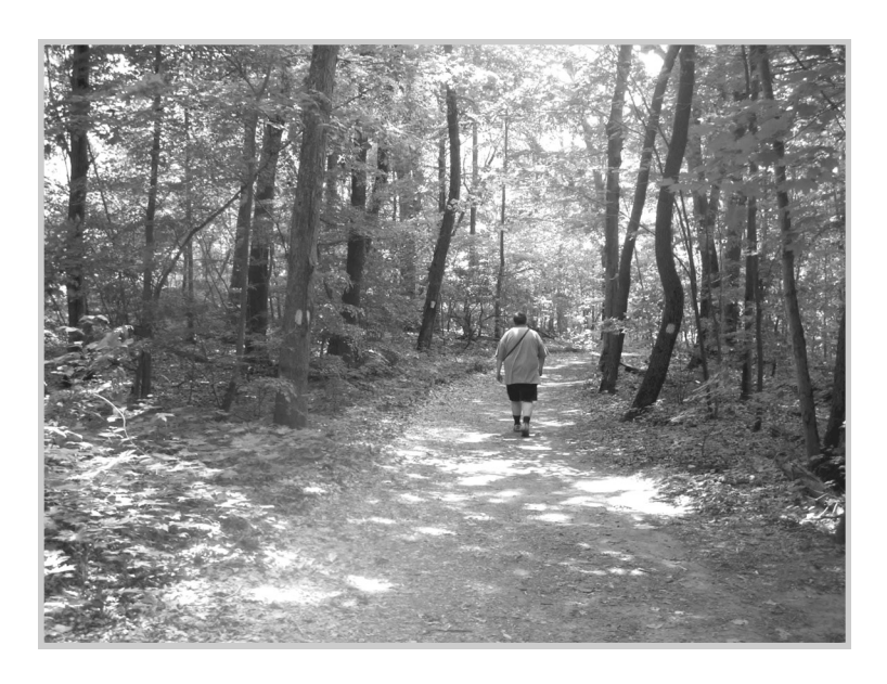
Millers Pond State Park, Durham