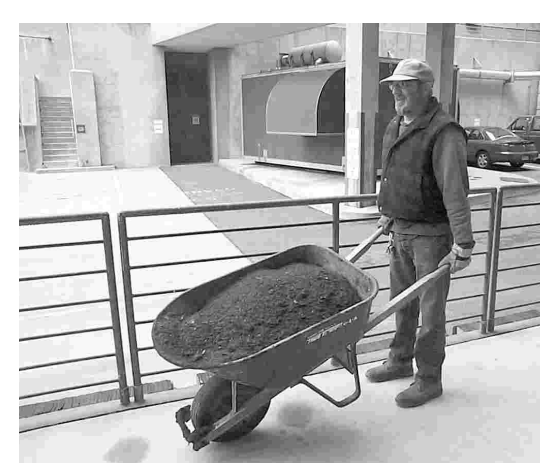
A wheelbarrow full of finished compost.