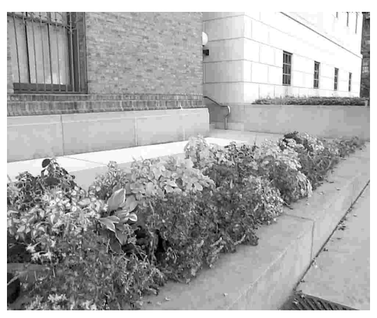
The DEP Headquarters' plantings thrive with compost.