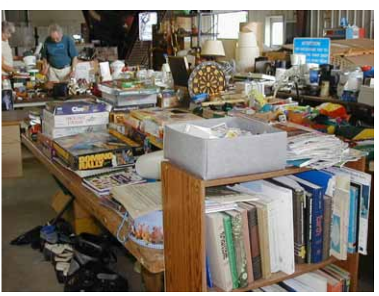
Mansfield residents can browse through the great finds at the town's swap shop.