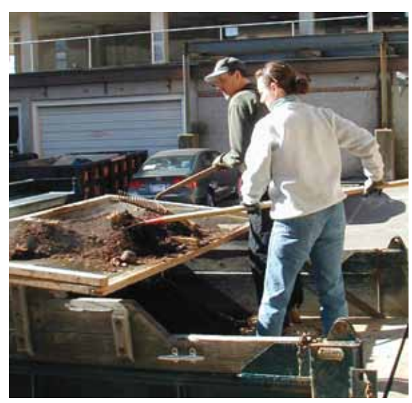
Food waste is composted and screened at the DEP headquarters.

The Green Team is made up of volunteers from a cross-section of departments and jobs. They work very closely with the building manager and cleaning crew to ensure that the recycling, composting, and special projects, like building-wide cleanouts, run smoothly. The group meets monthly. Subcommittees work on specific projects such as getting the word out, purchasing environmentally preferable products, and DEP's ReSupply Center (see story on page 6). Continued on page 2