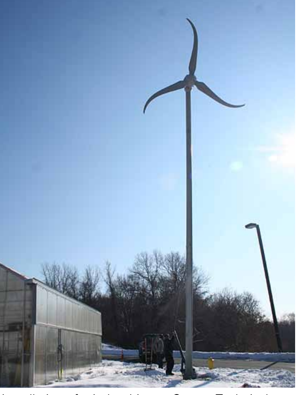
Installation of wind turbine at Grasso Technical High School in Groton