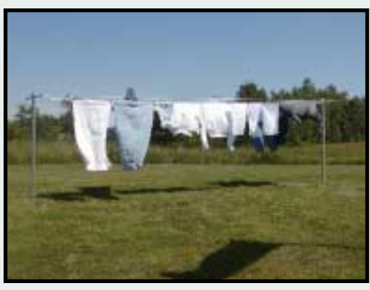
The ultimate energy-saving clothes dryer