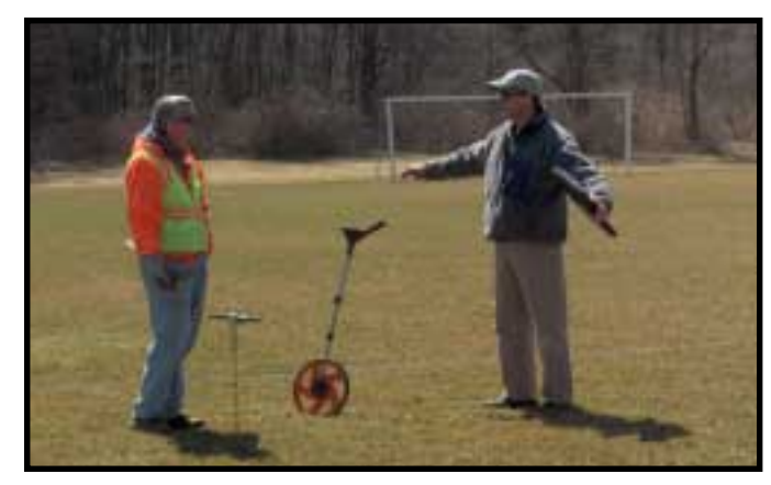
OLC Professional conducts site assessment with Manchester

Following the distribution of its Organic Land Care DVD, DEP solicited applications from municipalities interested in participating in a pilot project to demonstrate organic