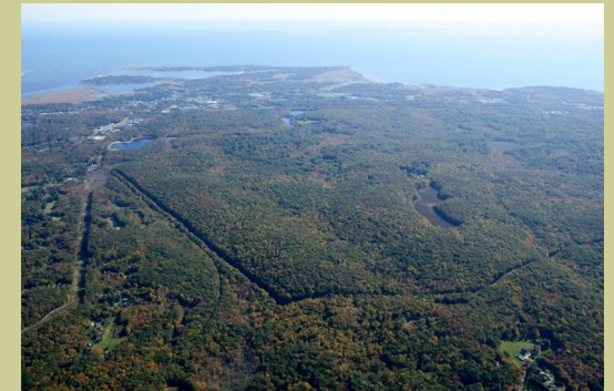
The Preserve Old Saybrook, Westbrook, Essex