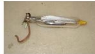
Ampoule with Hg removed from T'stat