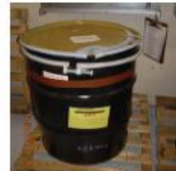
Barrel of Ampoules ready to be sent to recycler