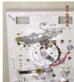
Thermostat received and ready for Hg ampoule removal