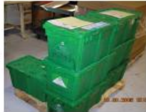
Bins ready to send to Collection Points (HHW, Contractor or Distributor)