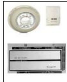
Examples of thermostats with Hg