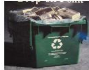
Thermostats collected and ready to be sent to the TRC