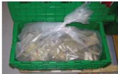
Bin received at the TRC