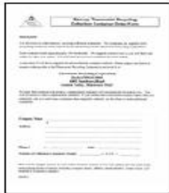
Recycling bin order form