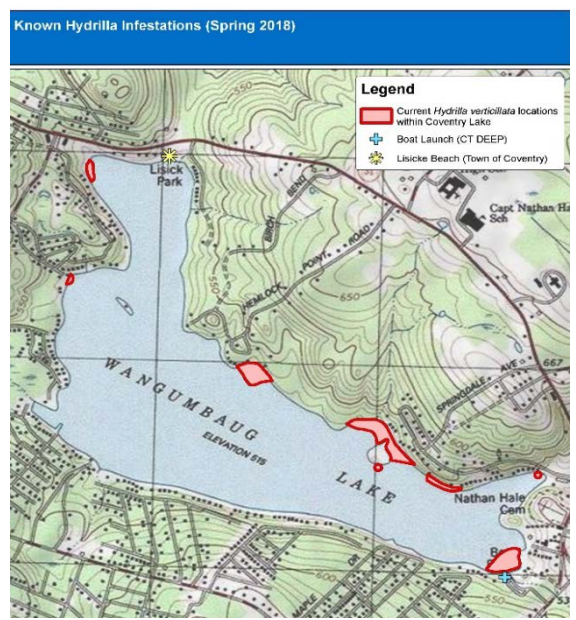
Known locations of hydrilla at Coventry Lake (Wangumbaug Lake). Boaters should avoid these areas noted with red to avoid fragmenting and spreading hydrilla.

COVENTRY LAKE (invasive species alert). Hydrilla, a very highly invasive aquatic plant, has been found growing in Coventry Lake. All lake users should take extra care to check and clean their boats (including canoes, kayaks and rowing sculls), trailers, and fishing equipment before leaving the launch.