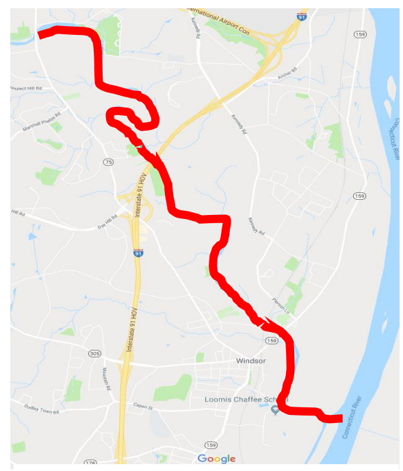
Section of the lower Farmington River possibly affected by the recent firefighting foam release under the cautionary advisory.

IMPORTANT NOTICE - Please note that an accidental release of fire-fighting foam from a hangar at Bradley International Airport on June 9. DEEP and the Department of Public Health have lifted the advisory concerning boating and swimming in this section of the lower Farmington river. The advisory to not eat fish caught from this area remains in place until further testing is completed and results analyzed.