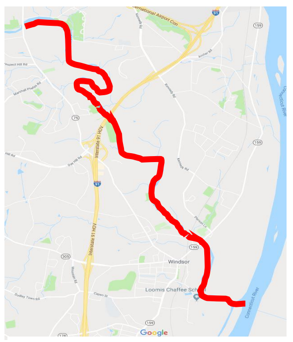
Section of the lower Farmington River possibly affected by the recent firefighting foam release under the cautionary advisory.

IMPORTANT NOTICE - Please note that an accidental release of fire-fighting foam from a hangar at Bradley International Airport on June 9. DEEP and the Department of Public Health have lifted the advisory concerning boating and swimming in this section of the lower Farmington river. The advisory to not <a href="mailto:eat-fish caught from this area remains in place until further testing is completed and results analyzed">eat-fish caught from this area remains in place until further testing is completed and results analyzed</a>.