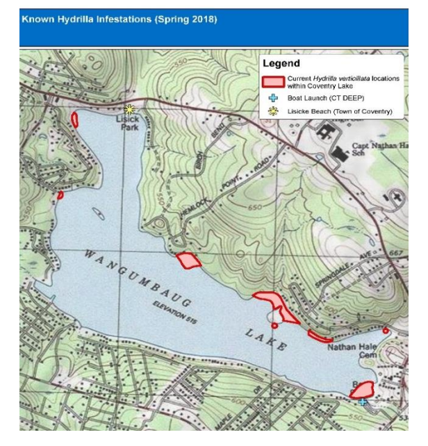
Known locations of hydrilla at Coventry Lake (Wangumbaug Lake). Boaters should avoid these areas noted with red to avoid fragmenting and spreading hydrilla.

STANLEY QUARTER PARK POND (drawdown). A 2-3 foot drawdown for dam repairs is ongoing. Accessing the water may be limited.