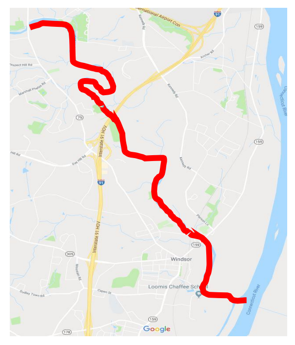
Section of the lower Farmington River possibly affected by the recent firefighting foam release under the cautionary advisory.

IMPORTANT NOTICE - Please note that an accidental release of fire-fighting foam from a hangar at Bradley International Airport on June 9. DEEP and the Department of Public Health have lifted the advisory concerning boating and swimming in this section of the lower Farmington river. The advisory to not <u>eat</u> fish caught from this area remains in place until further testing is completed and results analyzed.