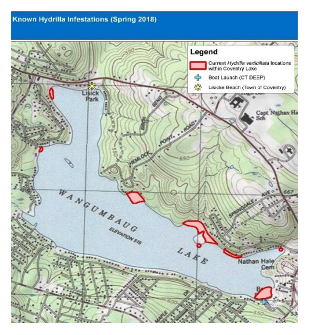
Known locations of hydrilla at Coventry Lake (Wangumbaug Lake). Boaters should avoid these areas noted with red to avoid fragmenting and spreading hydrilla.

STANLEY QUARTER PARK POND (drawdown). A 2-3 foot drawdown for dam repairs is ongoing. Accessing the water may be limited.