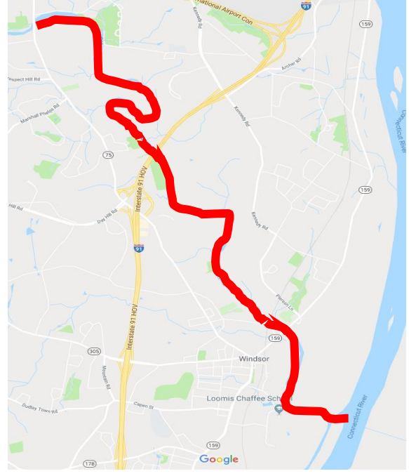
Section of the lower Farmington River possibly affected by the recent firefighting foam release under the cautionary advisory.

IMPORTANT NOTICE - Please note that an accidental release of fire-fighting foam from a hangar at Bradley International Airport on June 9. DEEP and the Department of Public Health have lifted the advisory concerning boating and swimming in this section of the lower Farmington river. The advisory to not <u>eat</u> fish caught from this area remains in place until further testing is completed and results analyzed.