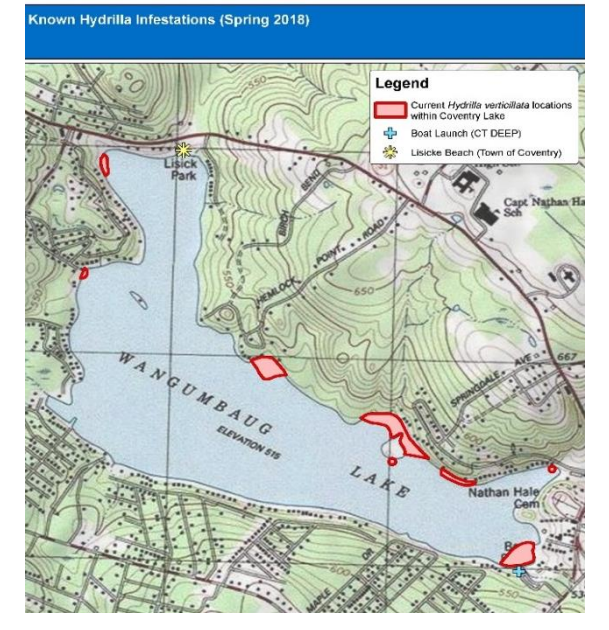
Known locations of hydrilla at Coventry Lake (Wangumbaug Lake). Boaters should avoid these areas noted with red to avoid fragmenting and spreading hydrilla.

STANLEY QUARTER PARK POND (DRAWDOWN). A 2-3 foot drawdown for dam repairs is ongoing. Accessing the water may be limited.